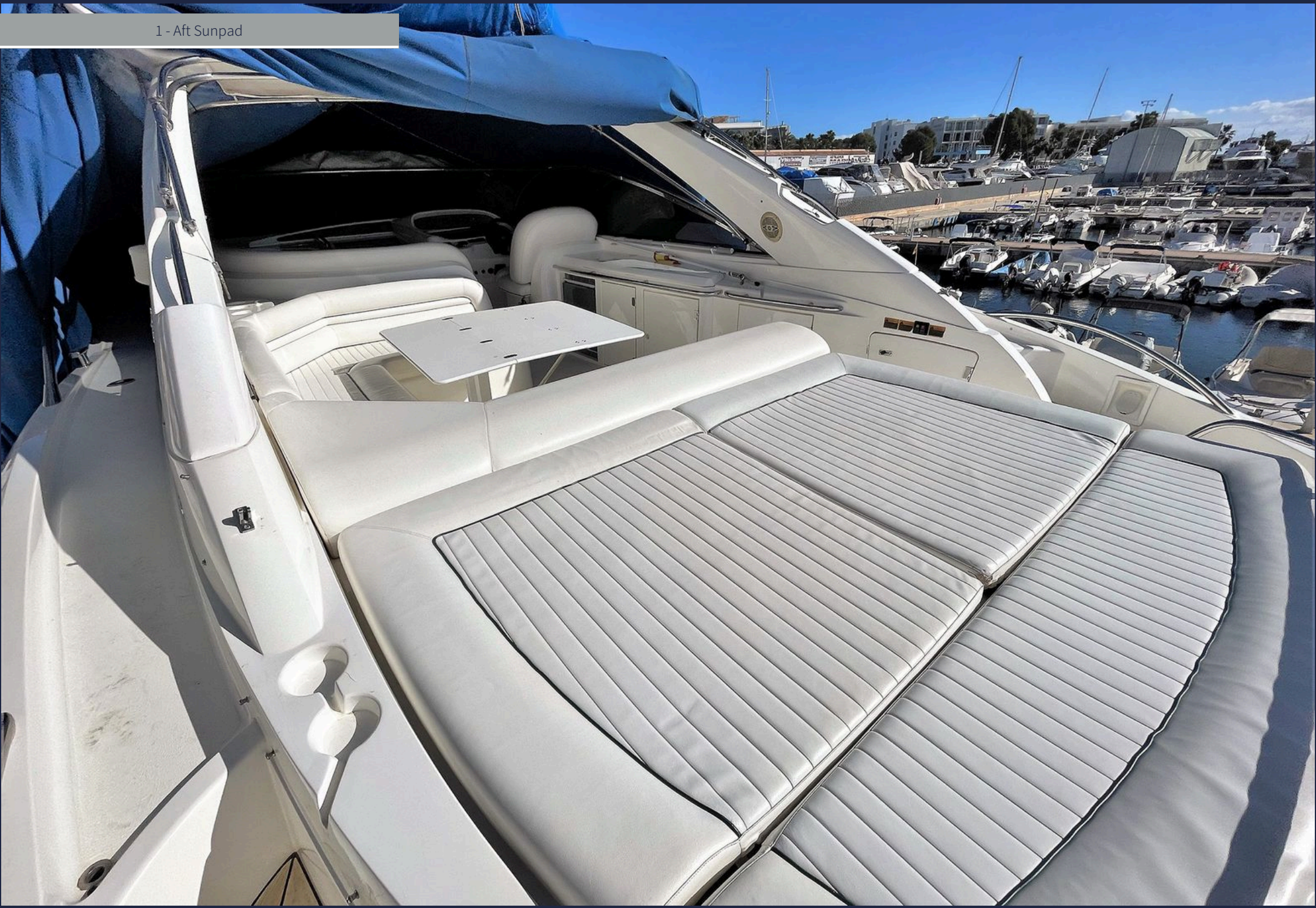
1 - Aft Sunpad