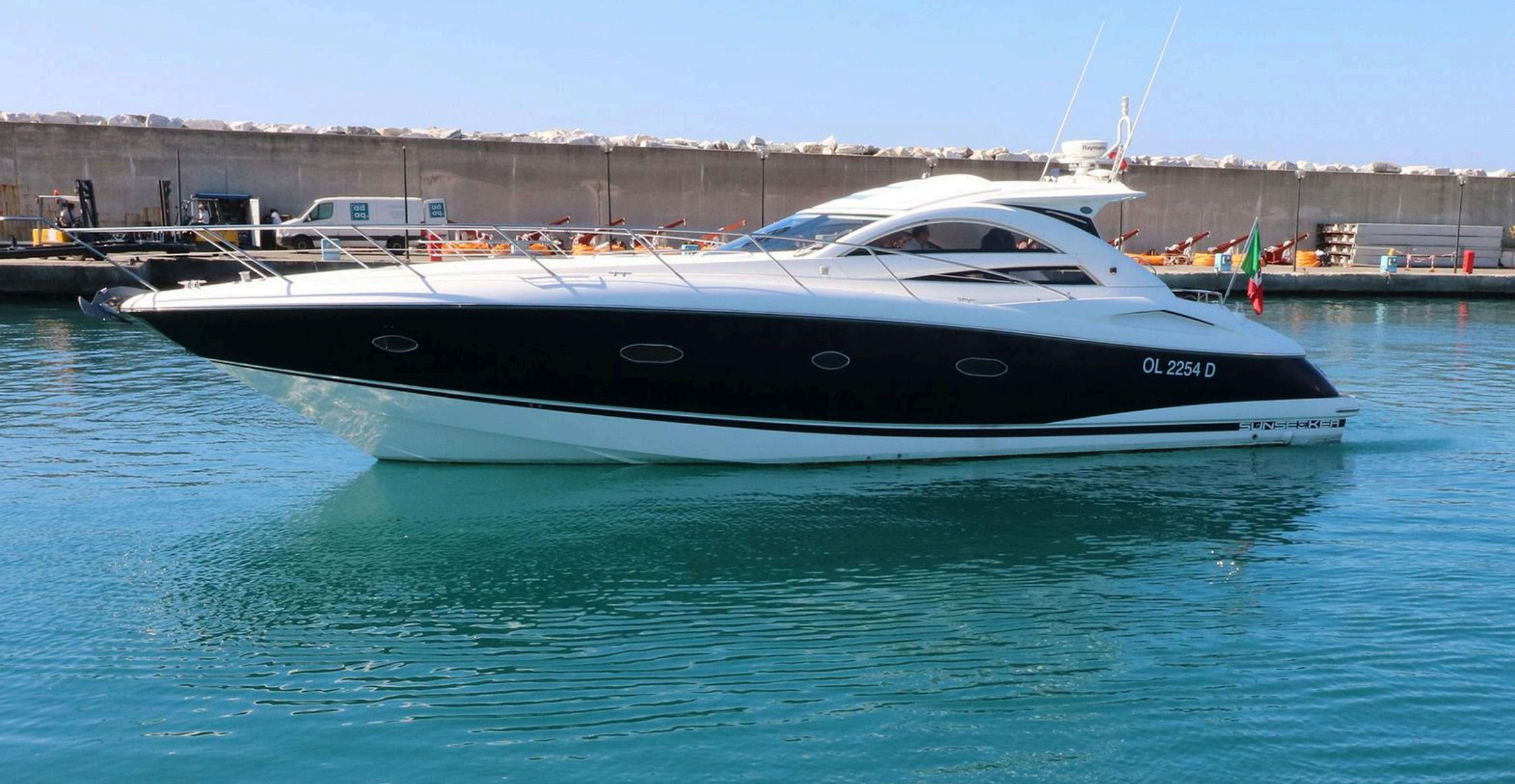
Sunseeker Portofino 53 MKII - LADY GIULIA € 370,000 EUR Tax Paid